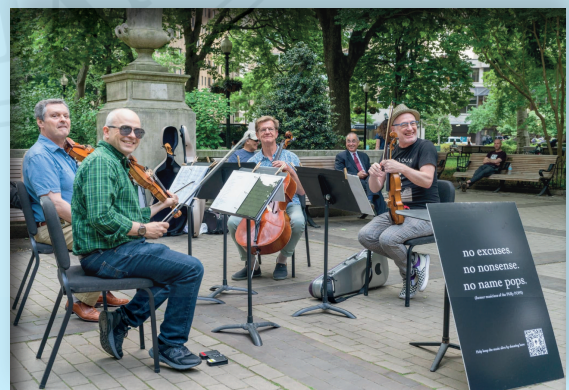
The No Name Pops string quartet performs for guests in Rittenhouse Square