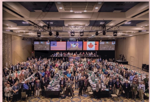
102nd AFM Convention group photo