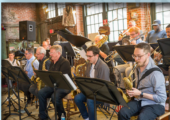
The No Name Pops big band performs for guests at the Black Squirrel Club in May, 2023.