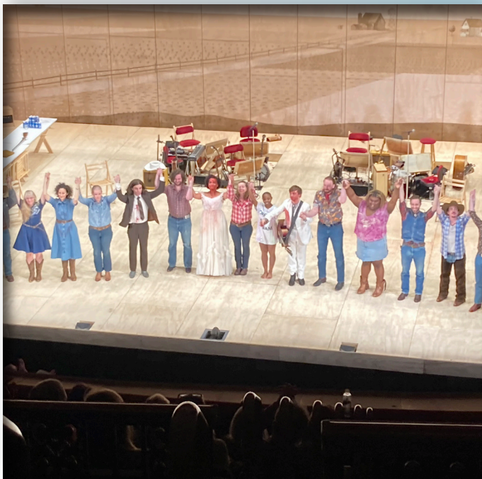
The cast of Oklahoma! takes a bow during their run at the Forrest Theatre from March 8-20, 2022