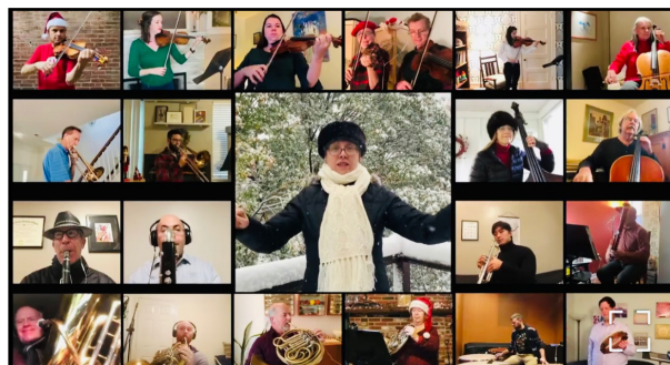
Pennsylvania Ballet Virtual Performance