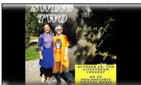
Swing Two October 28, 2020