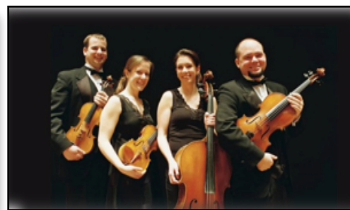
Elysium Quartet December 9, 2020