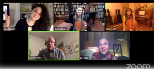
Wednesday August 19 th Cellists of the PVMP