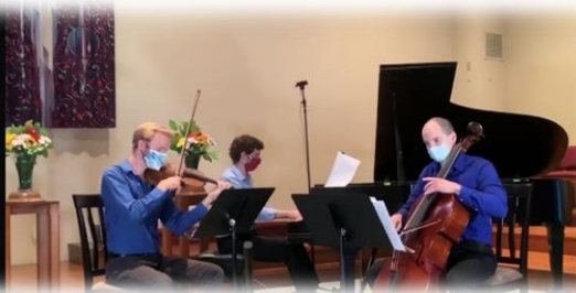
Saturday August 1 st Esherick Trio