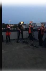
Wednesday September 16 th Elegance Quartet