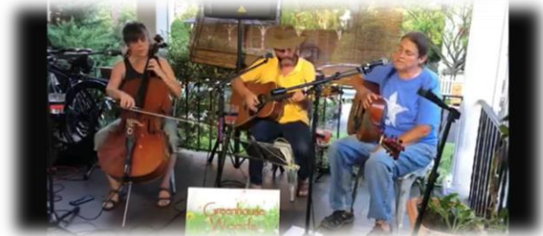
Wednesday July 29 th Greenhouse Weeds