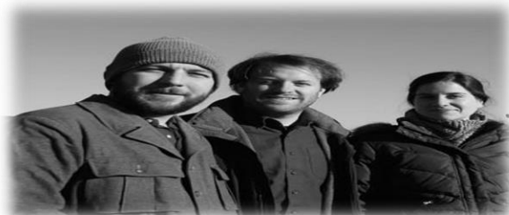
Wednesday September 23 rd The Hollows, Fiddle & Folk Music