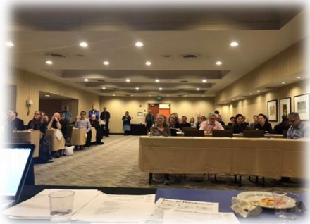
General Membership meeting at the DoubleTree Hotel on March 5 th , 2020