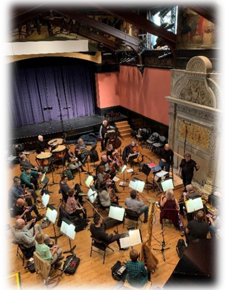
AVA Dress Rehearsal recorded as a performance for local broadcast due to venue shutdown