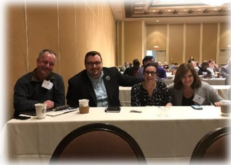
Local 77 Officers & Board members attending the AFL-CIO 2020 Conference in Atlantic City

A live broadcast on Facebook reached 5,000 live listeners and hundreds of thousands more saw the broadcast on WHYY and on our website. Thanks to Local 77 for facilitating a Zoom meeting for the members of the orchestra. The orchestra members voted for a salary reduction for the rest of the season to help the Philadelphia Orchestra Association weather the storm. We also launched the Virtual Philadelphia Orchestra. Check out the orchestra website and “Watch, Listen and Learn” . Archival video and audio performances and live educational presentations are being streamed each week. These are strange times but with the musicians, staff, board, and Local 77, all working together, we hope to be able to ride this out.