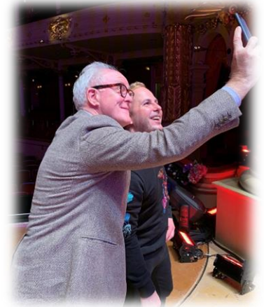
Maestro Yannick Nezet-Seguin with special guest Actor John Lithgow in rehearsal for the 163 rd Academy of Music Anniversary