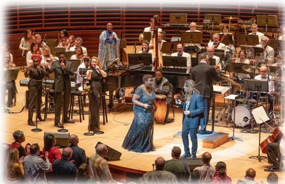
Philly POPS Aretha: Respect concert series February 14 th – 16 th