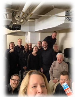
Pit visit at the Academy of Music With local and traveling musicians Hello Dolly! , February 22 nd – Mar. 1 st