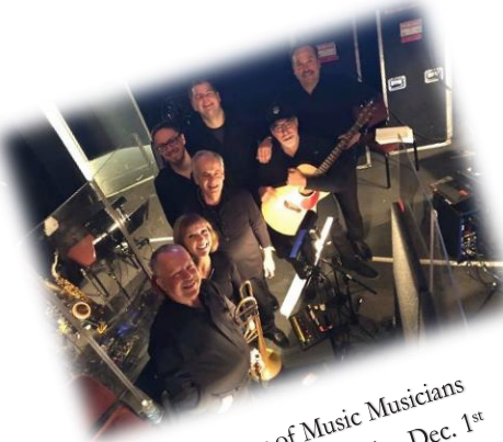
Academy of Music Musicians Mean Girls, Nov. 20th – Dec. 1st