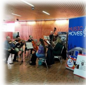
Chamber Orchestra of Philadelphia Musicians serenading Septa travelers on 10/26