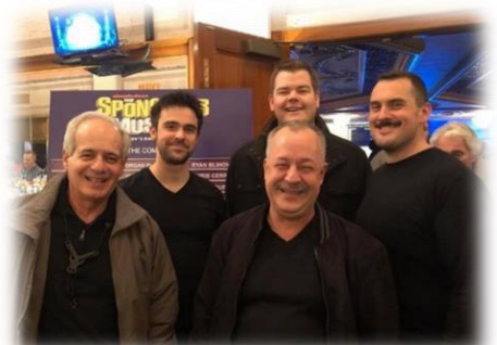
Forrest Theatre Musicians The SpongeBob Musical , Dec. 3rd – Dec. 15th