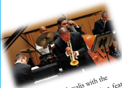
Wynton Marsalis with the Philadelphia Orchestra in December, featuring a limited run of the Pulitzer Prize winning composition Blues Symphony