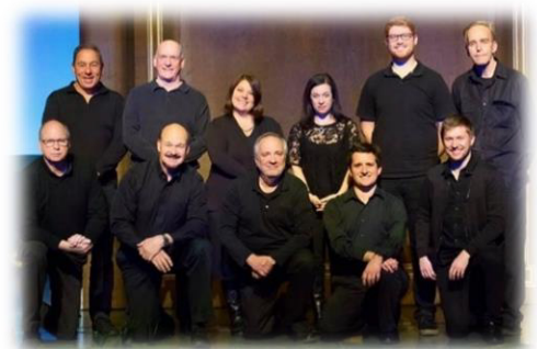
Walnut Street Theatre Musicians Sbrek The Musical , Nov. 5th – Jan 5th