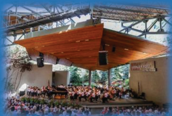
Vail, CO July 2019

Two weeks back at the Mann Center followed by our annual 3-week stint at Saratoga rounded out our summer season. We look forward to our return to the Kimmel Center this fall with a newly renovated Orchestra Lounge!