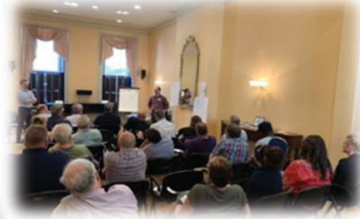
Organizing Training Day Academy of Vocal Arts, July 2019