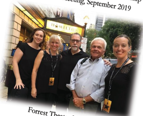
Forrest Theatre Musicians Hamilton, Aug 27th -- Nov 17th