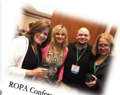
ROPA Conference: Boston, MA July 2019