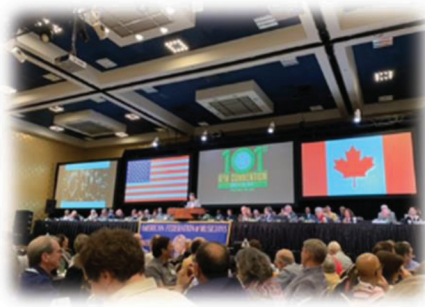
AFM Convention: Las Vegas, NV June 2019