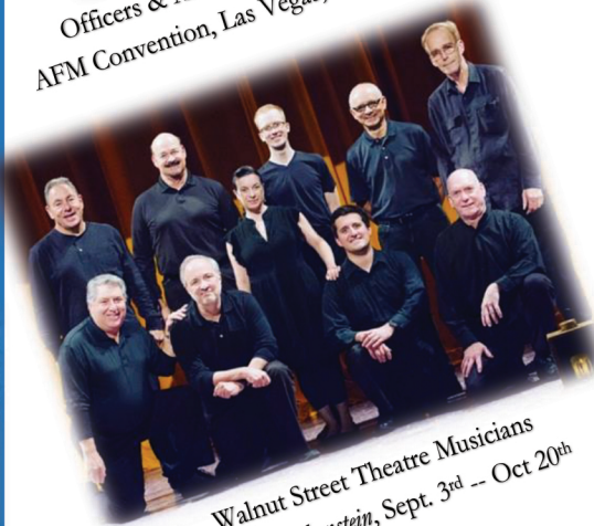
Walnut Street Theatre Musicians Young Frankenstein, Sept. 3rd -- Oct 20th