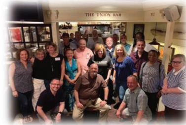
TMA Conference: Boston, MA July 2019